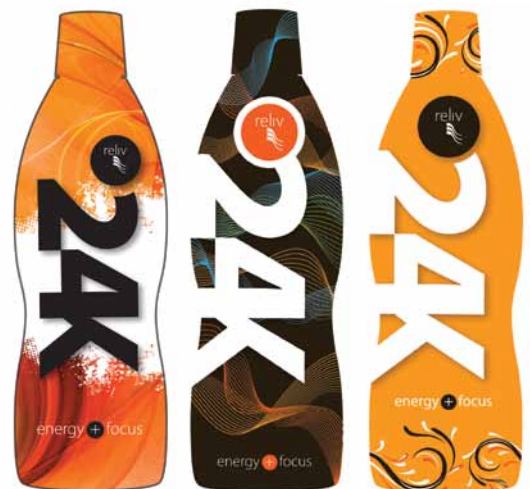
other design concepts considered